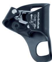
CAM CLEAN RK805BB00